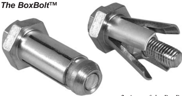
2 views of the BoxBolt, one before installation, and the other with fins expanded.