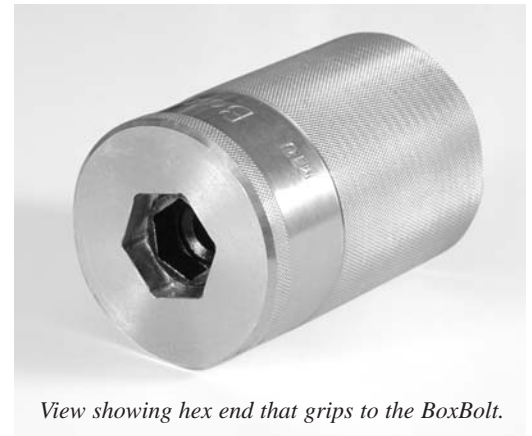
View showing hex end that grips to the BoxBolt.